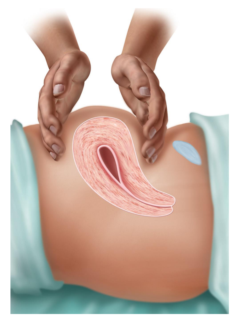
Figure 19-9 Suggested method of palpating the fundus of the uterus during the fourth stage. The left hand is placed just above the symphysis pubis, and gentle downward pressure is exerted. The right hand is cupped around the uterine fundus.