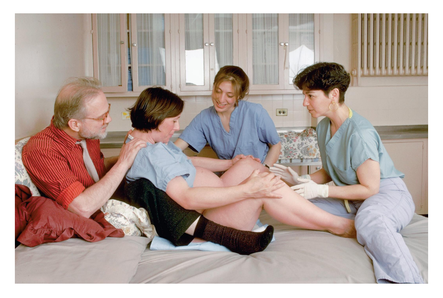
Figure 19-4 The nurse provides encouragement and support during pushing efforts.